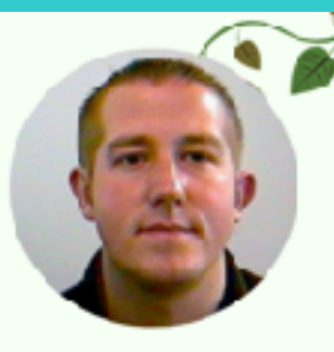
Jason Lappin Entertainments