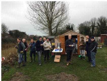
FVCS Allotments and Hanging Baskets Group

We had a really busy work party on January 19 th with a great turnout despite the damp conditions. The next work party will be on March 16 th . The Open Day and plant sale will be on May 18 th